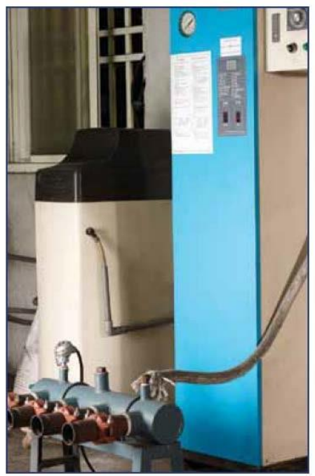
Laboratory hot water testing